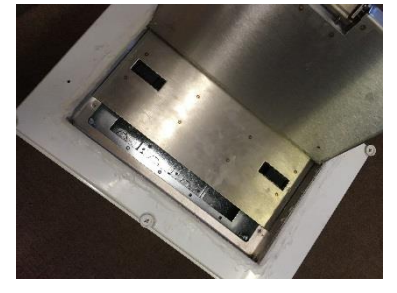
Sealing plate in user position